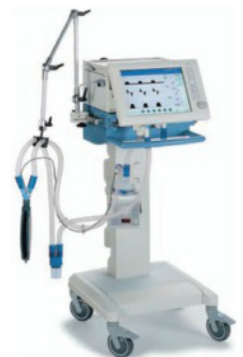
Ventilator Weaning Program

We are proud of our expertise in ventilator weaning. It is our mission to make a difference in the lives of our patients. Our achievements are made possible because our team is dedicated to continuous improvement in serving our patients with the best quality care.