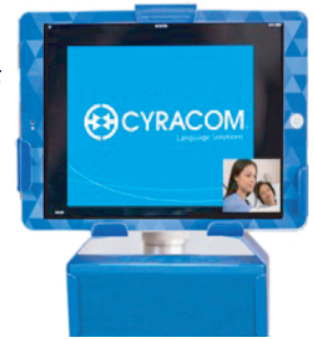
CyraCom Translation Unit

Our team members can select the appropriate language and adjust camera and sound to serve the needs of our patient or family member. Each Barlow location has multiple CyraCom video interpretation units to ensure ADA and HIPAA compliant, consistent, reliable, real-time interpretation.