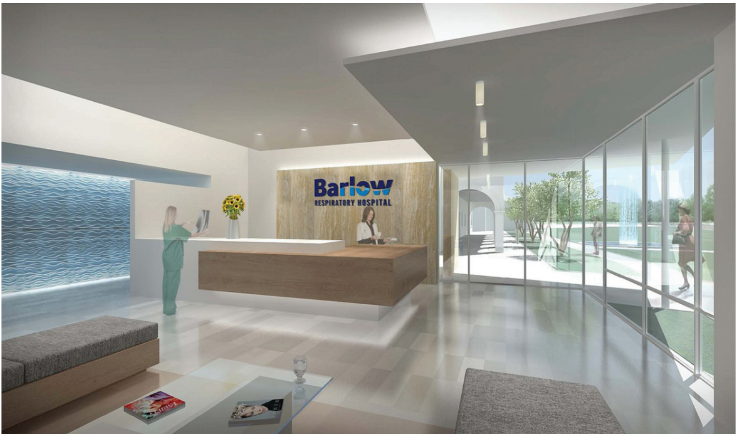
Images are artist renderings of the new Barlow Respiratory Hospital - Courtesy of Zakian Woo Architects

We will provide the advantage of an expanded intensive care unit, new imaging equipment and a new surgical suite.