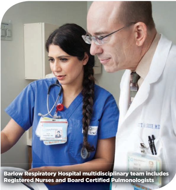
Barlow Respiratory Hospital multidisciplinary team includes Registered Nurses and Board Certified Pulmonologists