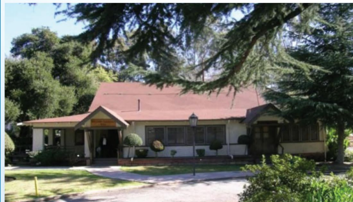
Williams Hall constructed 1910

1910 - Williams Hall constructed for patient recreation, stage plays, writing and patient library