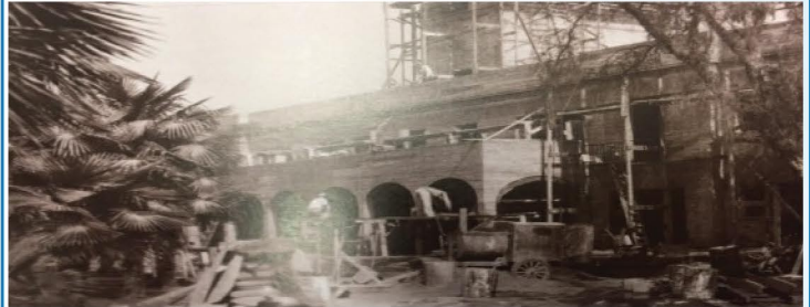
ReBuilding Barlow after infirmary burned down, construction of current hospital, 1927

1925 - Infirmary, built in 1902, destroyed by fire