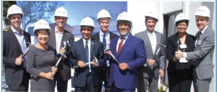
Seismic retrofit begins with "breaking down walls" ceremony in 2018