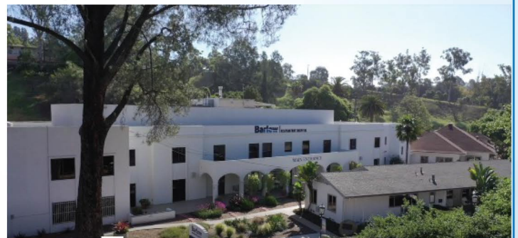
Barlow Respiratory Hospital

1960 - New name, new focus: Barlow Sanatorium transforms into Barlow Respiratory Hospital, to treat patients with chronic respiratory diseases