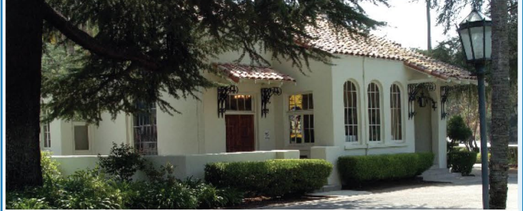
Library constructed 1922

1922 - Library constructed for medical texts