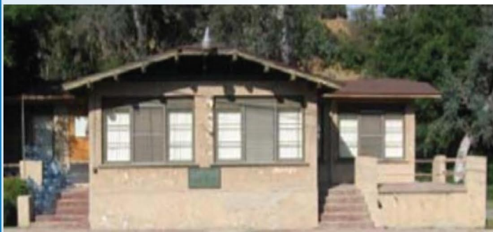
American Red Cross Cottages constructed 1919

1919 - American Red Cross donates funds to construct cottages for veterans returning from WWI