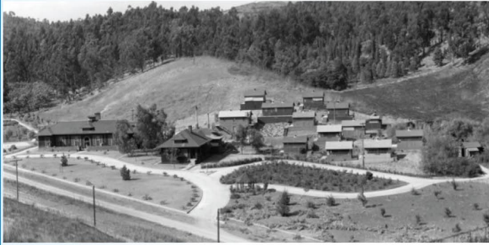
Barlow Sanatorium first buildings constructed in 1902

1902 - Infirmary and cafeteria buildings constructed. Barlow kitchen/cafeteria is still in use after 120 years