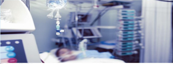
Patient on Ventilator