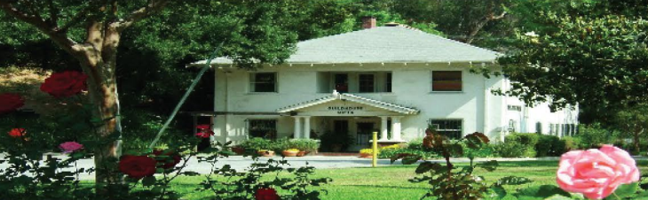
Guild House constructed 1920, repurposed as gift shop 1975