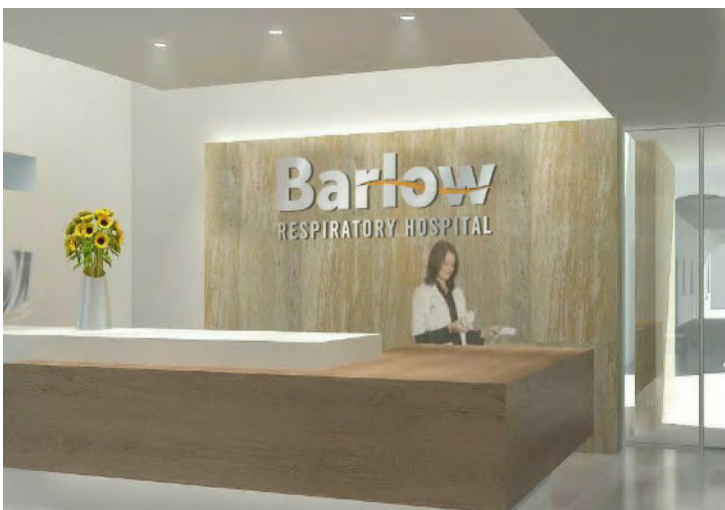
Artist Rendering of new Barlow Respiratory Hospital lobby Zakian Woo Architects